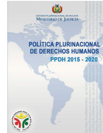
Plurinational Policy on Human Rights