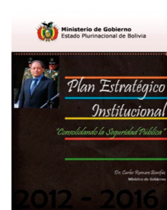
Strategic Plan of the Ministry of the Interior