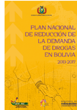
National Drug Demand Reduction Plan

The Country Programme is also in line with the sectorial strategies of the Plurinational State of Bolivia, including amongst others :