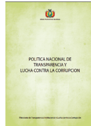
National Transparency and Anti-Corruption Policy