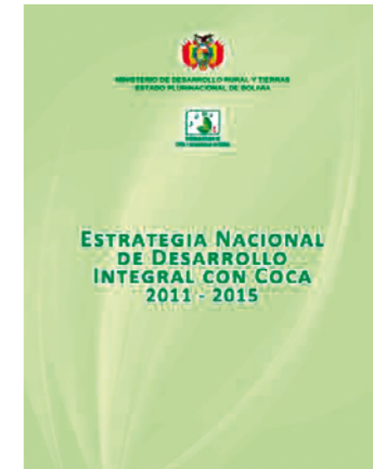
National Strategy for Comprehensive Development with Coca