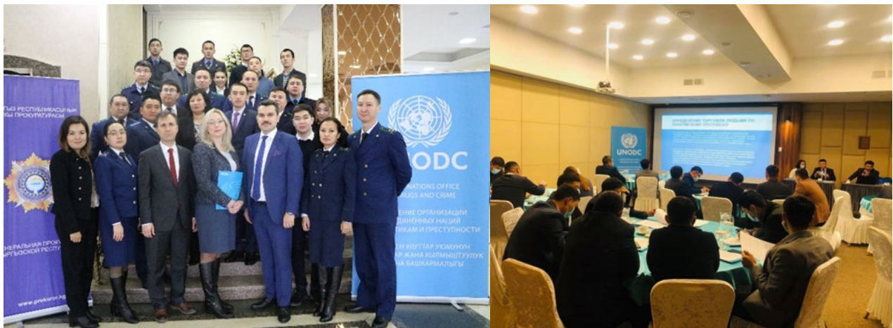
Photo caption: Participants of the training sessions in Bishkek and Osh.

Another 56 prosecutors and police investigators enhanced their capacity on investigation and prosecution of TIP cases, including mutual legal assistance and SOP on detection, identification, and referral of TIP victims during a second round of training held in Osh and Bishkek in January 2020 and March 2021.