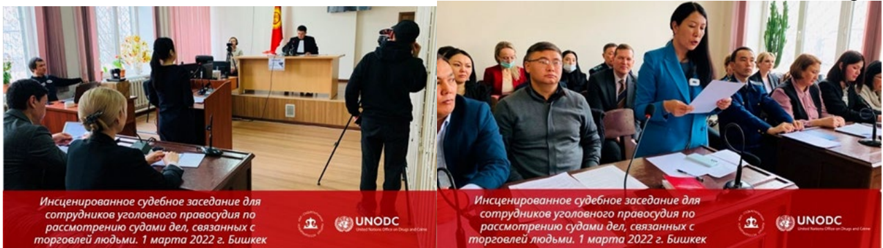
Инсценированное судебное заседание для сотрудников уголовного правосудия по рассмотрению судами дел, связанных с торговлей людьми. 1 марта 2022 г. Бишкек

The project partnered with the Kyrgyz Association of Women Judges to develop a methodology for capacity development on adjudication of TIP cases based on mock trial exercises. Using this methodology, the project trained 66 criminal justice practitioners (mostly judges and prosecutors, but also lawyers) who role played TIP cases in court. To supplement the methodology (i.e., Methodological Guidelines on Preparing and Implementing Mock Trials for Criminal Justice Practitioners on Countering Trafficking in Persons), the project produced a training video, which is available on the website of the Association of Women Judges.