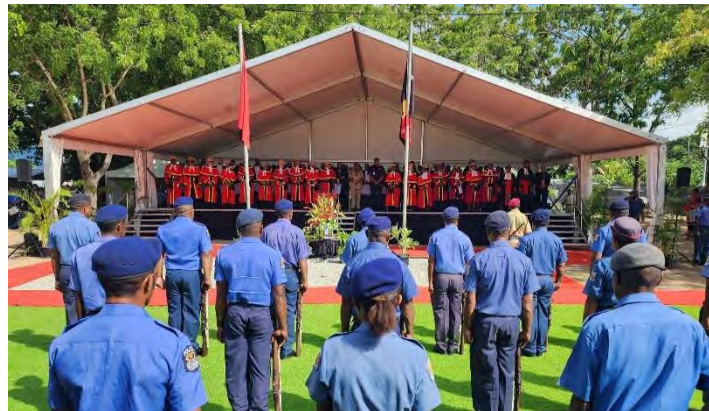
Assembly of police officers in Papua New Guinea (PNG) – April 2023