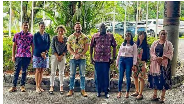
UNODC POFJ (Pacific Office Fiji) Team – June 2023