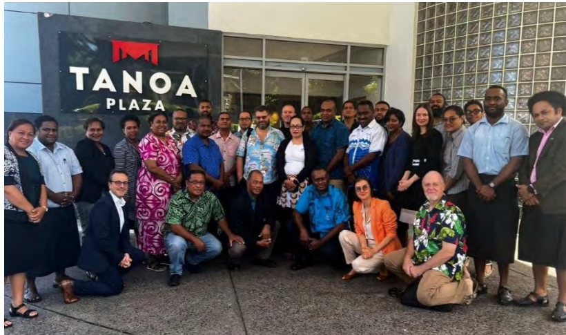
Participants of the Regional Forum on TIP and SOM – April 2023

data collection. Findings from a new study measuring human trafficking and migrant smuggling in the Pacific were presented and discussions were held to gather insights and national perspectives on the issue. The Forum enhanced cooperation between agencies and practitioners involved in anti-trafficking, counter-smuggling, and anti-corruption efforts to promote better detection, evidence gathering, and reporting of cases.