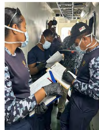
Maritime Police Officers training session – May 2023

It is anticipated that this training will be conducted in other Pacific Island Countries, specifically for maritime law enforcement officers who conduct maritime surveillance in their respective exclusive economic zones to ensure their border is safe from any/or all forms of maritime threats.