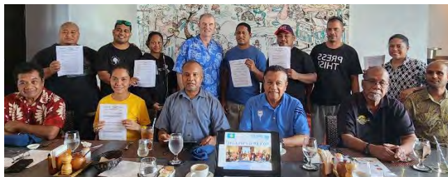
Palau Media Council with the Code of Conduct – May 2023