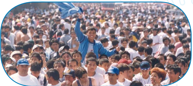
Colombian civil society commemorating 26 June, International Day against Drug Abuse and Illicit Trafficking