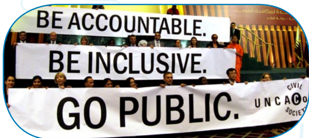
CSO participation at the UN COSP/CAC, Doha, Qatar Nov. 2009