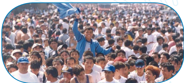
Colombian civil society commemorating 26 June, International Day against Drug Abuse and Illicit Trafficking