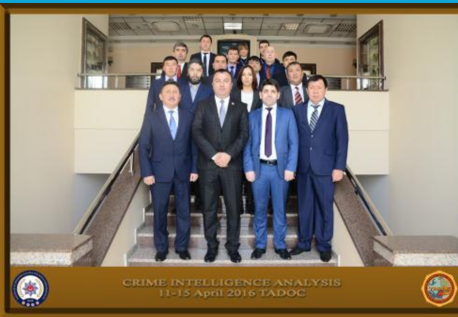
CRIME INTELLIGENCE ANALYSIS 11-15 April 2016 TADOC

United Nations Office on Drugs and Crime Regional Office for Central Asia