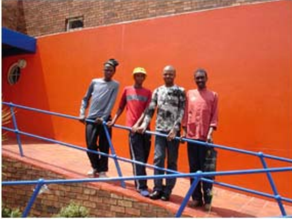
Photo gallery of centre interviews