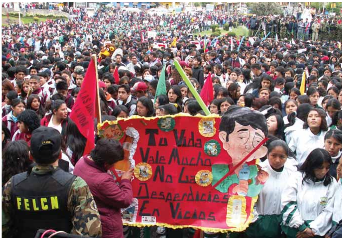
Thousands of young Bolivian students march against drugs in La Paz. Drug abuse prevention is a priority for the UNODC Country Office in Bolivia, which also promotes sustainable alternatives to planting coca bush.

“Corruption needs to be met head-on because a lot of people think nothing can be done about it.”