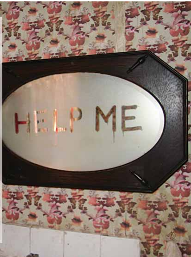
Photo here and on p. 20 taken from Emma Thompson's installation the "Journey".

The containers map the victim's journey, each marking a different stage in the trafficking process. The journey starts with a container titled 'Hope', which reflects the aspirations of young women as they leave their home. Containers 'Uniform', 'Bedroom' and 'Customer' offer disturbing insight into the daily ordeals of women trapped in the sex industry. The experience is all the more realistic as visitors are exposed to the sights, sounds and smells associated with sex work.