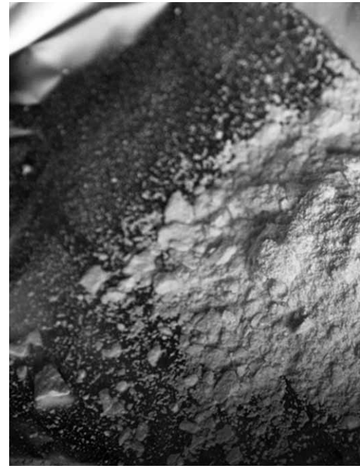
The seized drugs were then weighed.

tection. And should they be caught and imprisoned, they can easily buy their way out of jail.