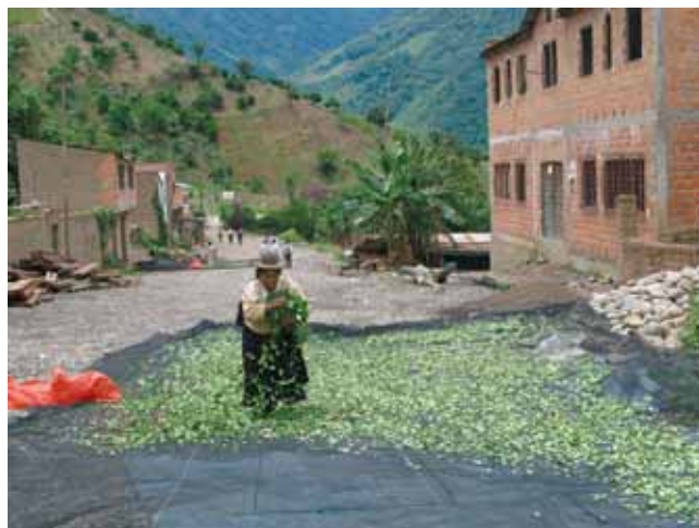
A Bolivian farmer dries coca leaves in the sun.