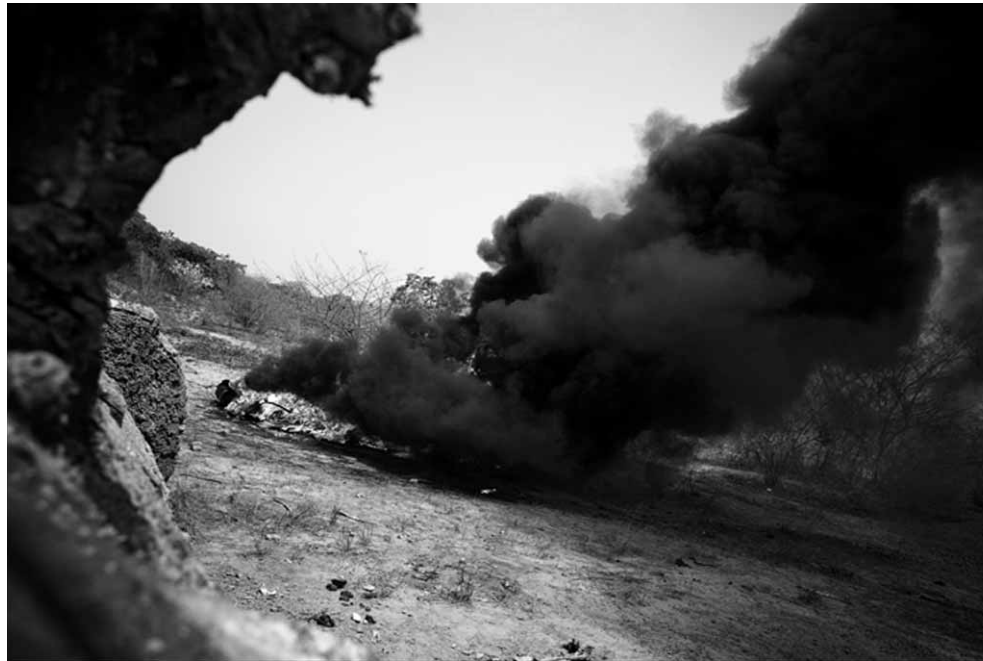
Finally, the police destroyed the cocaine.

Moreover, UNODC is currently preparing the establishment of an elite police unit comprised of key staff from the different law enforcement agencies. This structure is expected to serve as a role model for similar units in other areas.