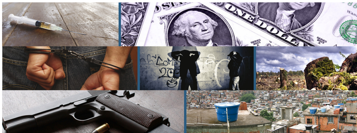
The costs of the war on drugs must be meaningfully counted and alternative approaches properly explored

The Count the Costs initiative aims to encourage civil society groups in all the fields that are impacted by the war on drugs to actively engage in this debate, both to inform it with their expertise and to call on local, national and international policy makers and UN bodies to meaningfully count the costs of the policies they are responsible for, and explore the alternatives.