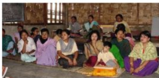
Under the project, NGOs established Self-Help Groups (SHGs) in their communities.

This project helped to establish an infrastructure comprised of NGO-based regional resource and training centres (RRTC), 25 NGO-based de-addiction cum rehabilitation centres and 40 Community Extension Centres, consisting of suitable community-based organizations (CBOs). The intention was to mobilize NGOs, CBOs and enterprises to reduce and prevent drug abuse on a large scale in the north eastern states of India which are highly exposed to drug abuse and related HIV/AIDS infection.