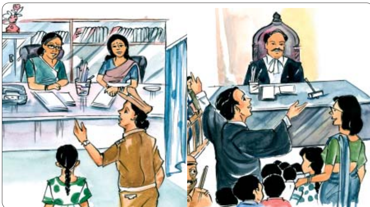
Producing the victim before CWC