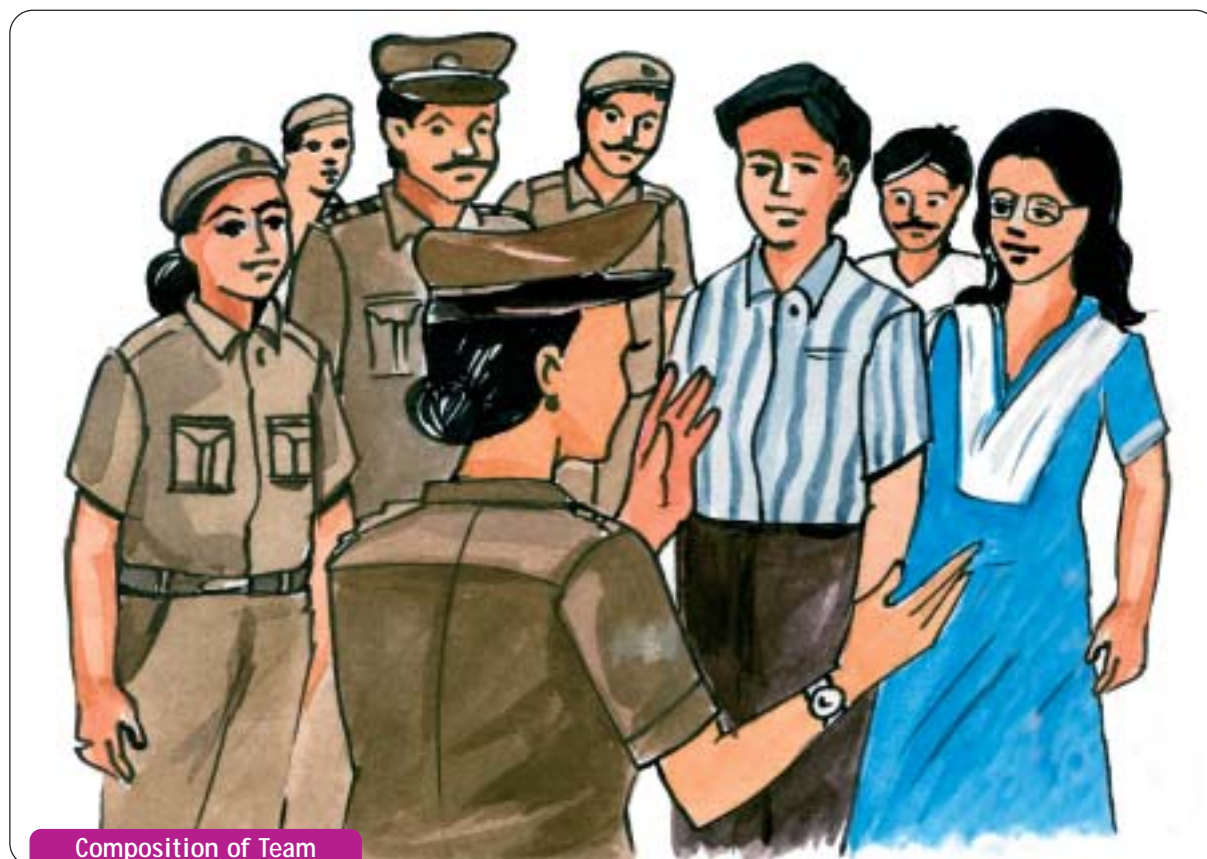
Composition of Team