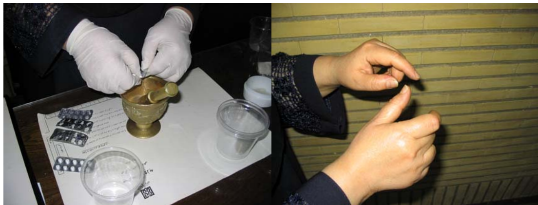
Figure 3. Blisters are much harder to open (left) and can wound the finger tips (right)

An unfortunate event regarding methadone dispensing occurred in December 2004. The manufacturing company changed the 100 tablet carrying plastic container to regular blisters of 10 (Fig 2). Apparently it was intended to facilitate counting of methadone on a more accurate basis. It was claimed that the plastic containers were cumbersome and occasionally had less or more than 100 which led to problems. Meanwhile it was stressed that it was hard to keep record of the tablets in such preparations. Regrettably such intention led to more rather than less problems. Blisters were more voluminous thus harder to carry and store. It was necessary to increase the number of safe boxes for same amount of methadone. Also extracting out 3,000 tablets a day by nursing staff turned out to a laborious chore (Figure 3). This showed a clear example of industrial efforts gone astray because of lack of communication with the consumers. Extracting tablets manually adds further to risk of contamination.