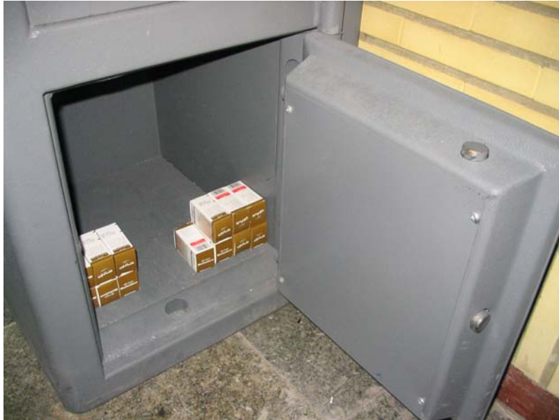
Figure 2. The newly manufactured methadone in blisters consumes 3 times more space than the previous package. Simple change making a need for much more safeboxes.

An unfortunate event regarding methadone dispensing occurred in December 2004. The manufacturing company changed the 100 tablet carrying plastic container to regular blisters of 10 (Fig 2). Apparently it was intended to facilitate counting of methadone on a more accurate basis. It was claimed that the plastic containers were cumbersome and occasionally had less or more than 100 which led to problems. Meanwhile it was stressed that it was hard to keep record of the tablets in such preparations. Regrettably such intention led to more rather than less problems. Blisters were more voluminous thus harder to carry and store. It was necessary to increase the number of safe boxes for same amount of methadone. Also extracting out 3,000 tablets a day by nursing staff turned out to a laborious chore (Figure 3). This showed a clear example of industrial efforts gone astray because of lack of communication with the consumers. Extracting tablets manually adds further to risk of contamination.