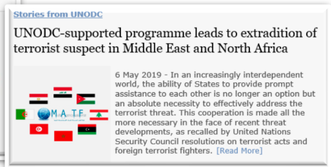
Webstory on www.unodc.org