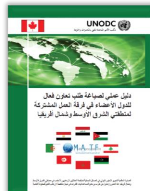
MATF Practical Guide

The guide includes, for each country, practical information on cooperation mechanisms, competent authorities, channels of transmission, requirements for requests to be admissible, specific conditions and the applicable national and international legal instruments. It facilitates access to the applicable law of the requested State and the identification of legal bases.