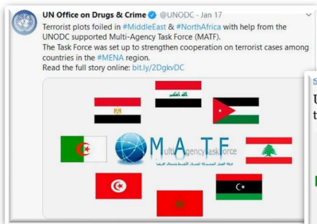
Tweet on @UNODC

A close coordination between agencies is all the more important in emergency situations, for example, in the imminence or in the aftermath of a terrorist attack, to ensure prompt response.