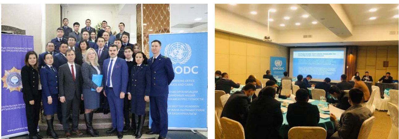
Photo caption: Participants of the training sessions in Bishkek and Osh.

Another 56 prosecutors and police investigators enhanced their capacity on investigation and prosecution of TIP cases, including mutual legal assistance and SOP on detection, identification, and referral of TIP victims during a second round of training held in Osh and Bishkek in January 2020 and March 2021.