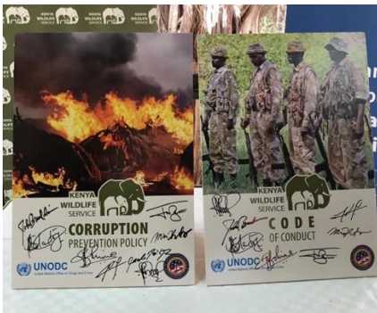
KWS Corruption Prevention Policy and Code of Conduct.