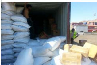
Container Search in Aqaba seaport

The Joint Port Control Unit at the seaport in Aqaba, Jordan, became operational on 1 September 2015. The Unit is made up of Customs, Police and Intelligence officers who work together on risk analysis and inspection of containers. UNODC had previously provided the Unit with the necessary equipment and training on communications software, risk analysis and container inspection. This will improve Jordan's capacity to facilitate legitimate trade and strengthen border control by correctly identifying and examining high risk containers for illicit trafficking. Jordan is the first country in the region to join the Container Control Programme , which covers cooperation among all the relevant authorities and agencies involved in border security.