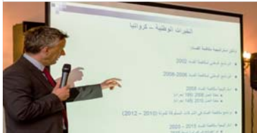
Anti-Corruption Strategies Presentation

The Administrative Control Authority received UNODC assistance throughout this quarter. A Workshop took place in July to discuss the obstacles faced by Egypt in implementing its National Anti-Corruption Strategy, identifying challenges and providing Egyptian authorities with best practices and recommendations. Further, the “Preliminary and Advanced Cyber-crime Investigation” training programme was delivered in August through 38 sessions over two weeks to participants having significantly varied backgrounds. Another event in September was entitled “Best Practices to Apply the One-Stop Shop in Egypt” where 47 government officials were presented and discussed the necessary skills and tools to implement this model in Egypt, to address potential gaps, and to identify needs for further improvements. The project is funded by the European Union.