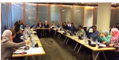
Civil and Common Law Practitioners' Debate

A workshop on "Key Components of an Effective Criminal Justice Preventive Response to Terrorism" was held in Amman in August, as a part of a Plan of Action established between Jordan and UNODC. The Workshop was opened by the representative of the Director of the