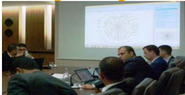
Crime analysis tools presentation

UNODC supports the Tunisian authorities in their efforts to prevent and combat organized crime and terrorism with a pilot programme on criminal analysis. Software, equipment and expert training were delivered to experienced professionals from the different structures of the