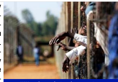
HIV and people in close settings

UNODC has been working closely with Morocco, a high-priority country, for more than a decade to advance the harm reduction agenda in the community and prison settings. Currently, UNODC is assisting national partners in conducting a study in five Moroccan prisons on drug use and HIV among the inmate population. The objective is to compile evidence on HIV in prisons, lay the foundation for the initiation of harm reduction services, and develop a prison health strategy in Morocco.