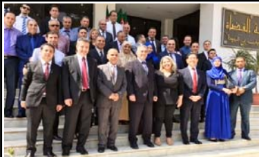
Algerian Judicial Professionals

Around 35 Algerian judges and prosecutors participated in the first UNODC train-the-trainers workshop, organized with the Algerian School of Magistrates, on strengthening international cooperation in criminal matters against complex cross-border terrorism cases. Technical discussions focused on current