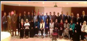
Training of Iraqi Delegation

With a view to facilitating policy dialogue among the Iraqi authorities to address the legal and practical challenges concerning women allegedly affiliated with ISIL (Daesh), UNODC held a workshop in Egypt for 18 Iraqi delegates in September. Among the delegates were a Member