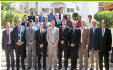
Joint Jordan-Pakistan Training

In July, the International Civil Aviation Organization and the UNODC Container Control Programme (CCP) undertook their first-ever joint activity in Jordan. The air cargo and mail security trainings involved officials from Jordan and Pakistan that are pioneer countries in implementing CCP at their airports.