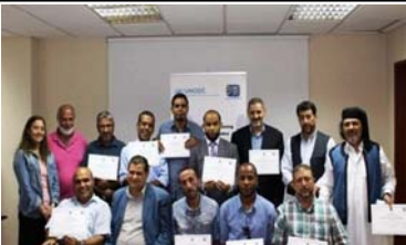
Certified HIV combatants

UNODC, in cooperation with MENAHRRA , held a workshop and a study tour to Lebanon for 14 Libyan public health professionals in July to build national capacities on HIV prevention, treatment and care. The training focused on the provision of comprehensive