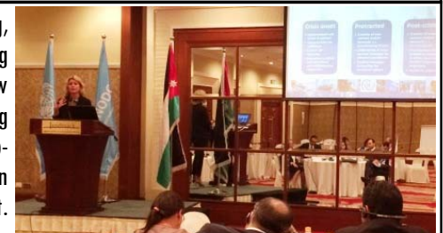
Trafficking expert addressing participants

To counter child trafficking, UNODC conducted a training in Jordan for Jordanian law enforcement on combating this crime, in close cooperation with the Jordanian Counter-Trafficking Unit. Presented in July, the event introduced to the