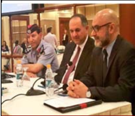
Jordan Minister of Justice Opens Regional Training

UNODC presented a regional training in Amman to address human trafficking victimization of refugees and displaced persons from Syria and Iraq. Participants included law enforcement officers, government officials and civil society actors from Egypt, Iraq, Jordan, Lebanon and Turkey dealing with refugees. While focusing on the detection and prevention of human trafficking and the provision of adequate victim assistance, the event also provided a platform for information exchange and in-depth training on the crime of human trafficking as well as the causes and effects behind the vulnerability of refugees, the challenges of addressing vulnerability to trafficking and possible ways forward. Project is funded by Austria.