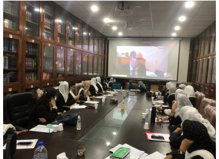
Online briefing to female anti-terrorism prosecutors in Pakistan

September 2020 – the SHERLOC team contributed to two Workshops on "Targeted Financial Sanctions in Countering the Financing of Terrorism and SHERLOC", organised by the UNODC Country Office Pakistan, in collaboration with the National Counter Terrorism Authority (NACTA). The SHERLOC team briefed the audiences of the two workshops - a group of Pakistani female anti-terrorism prosecutors and a group investigators from the Counter Terrorism Department (CTD) of Sindh Police – on the use of SHERLOC as a tool for legal information during investigation and prosecution of cases of terrorism and organized crime. An introduction to SHERLOC, and linkages between organized crime and terrorism, was followed by practical demonstration of the portal for the participants. To learn more, click here .