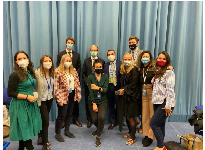
The team still smiling behind the masks at the end of a successful week

These side events provided an opportunity to discuss substantive issues, such as the latest trends and developments in organised crime as well as prevention of organized crime and responses thereto.