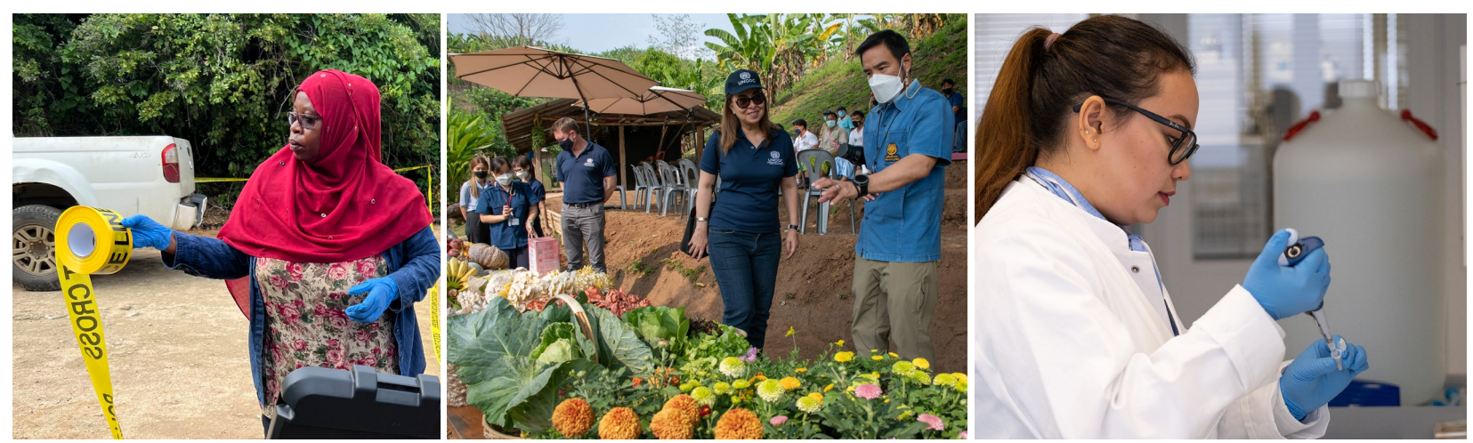
From left to right: UNODC law enforcement training in Kenya; Alternative development initiative in Thailand; a staff member in the laboratory at UNODC headquarters, Vienna, Austria.