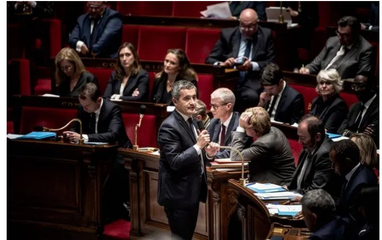
M. DARMANIN, French minister of the interior, speaking to the Parliament

main objective : make expertise available for training