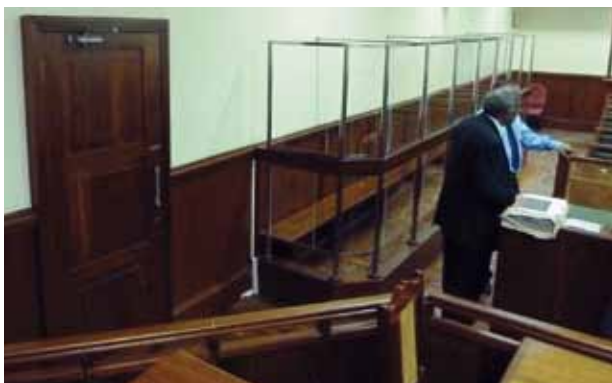
Inside the court room in Mauritius Intermediate Court

Following the signing of an agreement between the Government of Mauritius and EUNAVFOR to allow for the trial of piracy suspects in the nation's courts, UNODC has launched its third regional prosecution programme. As in Kenya and Seychelles, the Programme is run jointly with the European Union and aims to provide support for