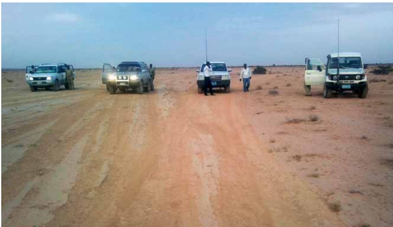
Heavily armed police provide support for the four hour drive to Eyl on Puntland's east coast

UNODC will use radio, TV and caravans of elders, clerics and community groups visiting remote locations, to broadcast these messages. Talkback radio is one medium that will be used heavily, as all Somalis have an opinion on piracy! (Current anecdotal evidence from talkback radio stations indicates about 70 percent of callers are against piracy). The programme aims to ensure that news of pirate arrests and convictions are reported widely into Somalia, and that good news stories where Somalis turn on pirates is reported out to the international community. Having seen a major success in Eyl with limited resources, UNODC hopes it can replicate this into more dramatic changes across the region.