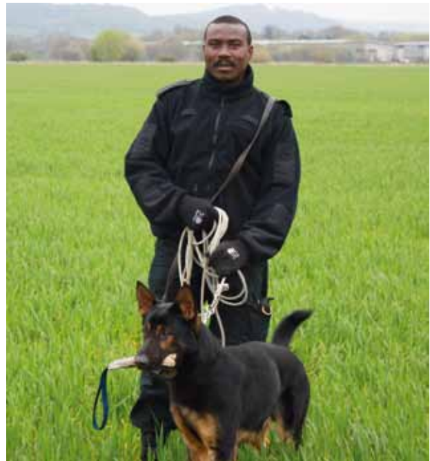
Training took place in Sussex, England

All the dogs are now operational. The general purpose dogs have had success in tracking suspects from house breaking crime scenes back to the suspects' houses. They have also been used in security patrols in the woods around Montagne Posee prison where Somali pirates are