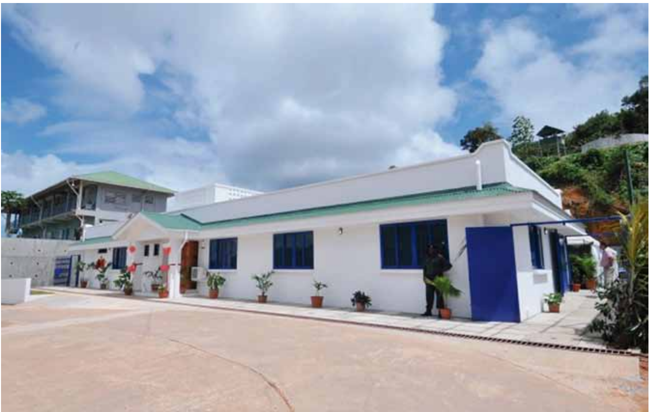
The front view of the new 60-bed prison facility at Montagne Posee Prison