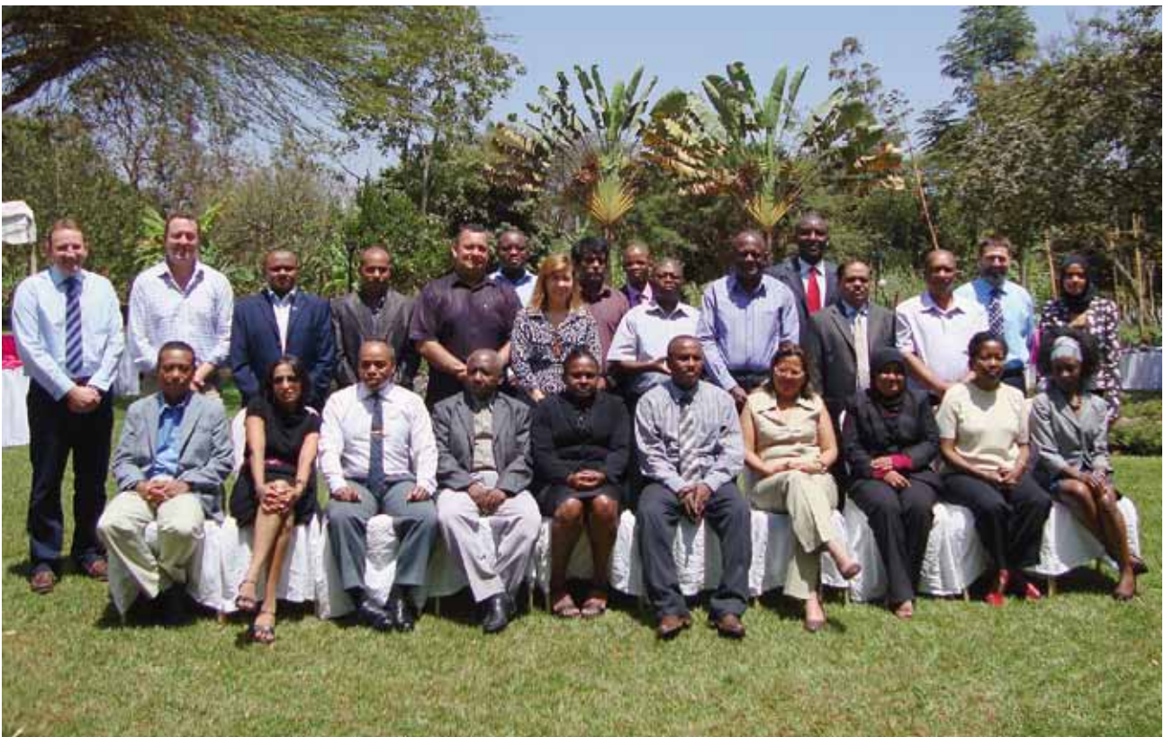
The course participants and facilitators at Safari Park Hotel