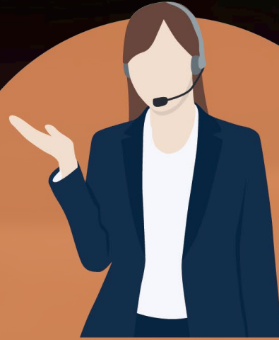
FIG Ethics Foundation Help Desk