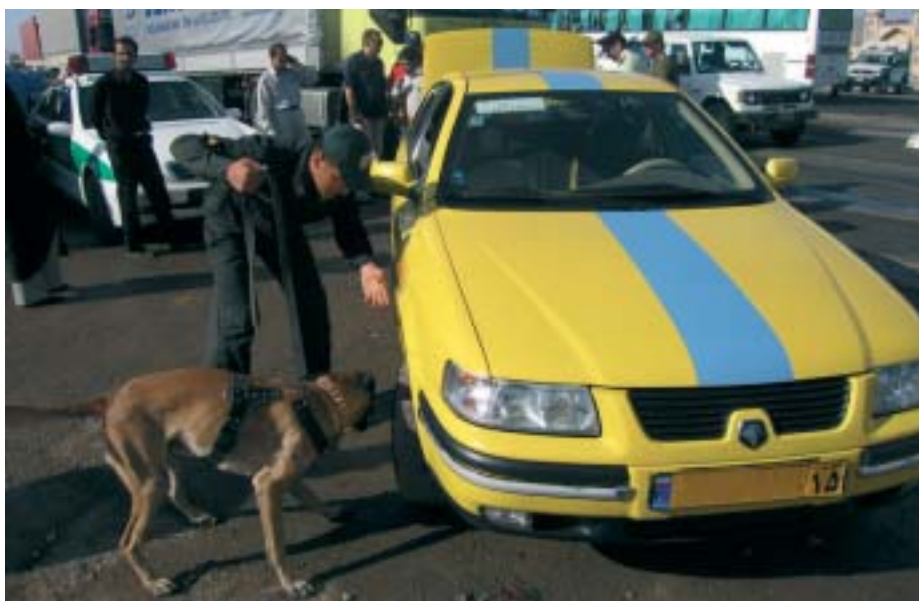
Iranian border police checking vehicles for drugs

A drug-abuse situation assessment conducted in 28 provinces and in Bam identified a number of drug-demand reduction responses to be addressed in future projects. Pilot drug-abuse prevention activities targeting street children were undertaken. A total of 40 journalists were trained in promoting the reduction of illicit drug supply and demand