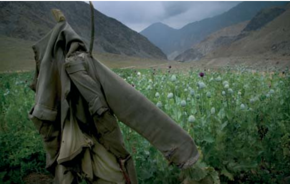
An opium field in Afghanistan

drug users within the country. In 2005, UNODC conducted its first survey of patterns of drug abuse in Afghanistan. The results were troubling, showing a total of around 920,000 drug users, including an estimated 150,000 using opium, 50,000 using heroin and 520,000 using hashish. The total represented around 1.4 per cent of the adult population. In response, UNODC was active in introducing many initiatives to reduce drug abuse and to counter its destructive effects on users.