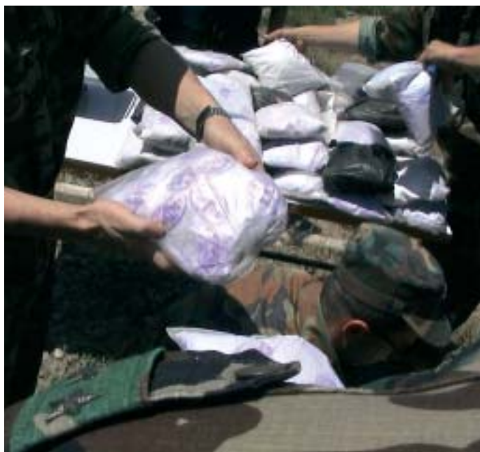
Heroin seizures in Uzbekistan

A host of promising new projects were initiated, including the region-wide effort to mobilize cooperation against drug trafficking under the Central Asian Regional Information and Coordination Centre (CARICC) located in Almaty, Kazakhstan. UNODC supported the creation of a single regional base for the communication, analysis and exchange of operational information as well as the planning and coordination of joint operations. The Centre is to be modelled on the lines of Europol, the law-enforcement intelligence agency for the European