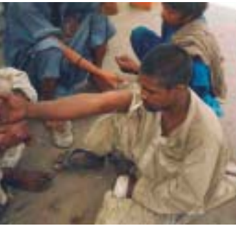
Down and out: poor and homeless people often turn to drug abuse