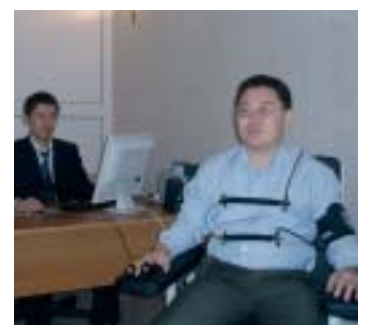
A law-enforcement officer from the Kyrgyz Drug Control Agency takes a polygraph test

A Drug Control Agency was also established in Kyrgyzstan, an important transit country for illicit drugs. In 2005, UNODC began applying a new concept to ensure the integrity of Kyrgyz DCA staff. Because corruption often undermines counter-narcotics efforts, UNODC began conducting polygraph tests on prospective candidates for DCA posts. Serving officers are also required to undergo lie-detector tests once a year. This has led to some important personnel changes in the agency and officers report a significant boost in morale as a result.