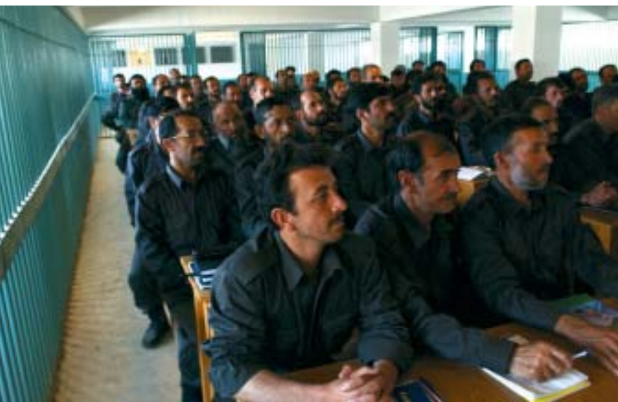
Law-enforcement officers in training

UNODC supported the Counter-Narcotics Police of Afghanistan (CNPA), part of the Ministry of the Interior, by providing training in basic and advanced drug law-enforcement and by strengthening infrastructure. While initial efforts focused on providing support to the CNPA Headquarters in Kabul, UNODC expanded the scope of its assistance in 2005 to seven strategic provincial centres: Herat, Helmand, Kandahar, Jalalabad, Mazar-e-Sharif, Kunduz and Faizabad.