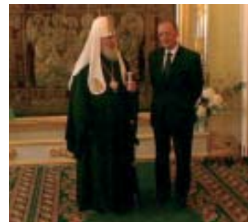
UNODC Executive Director Antonio Maria Costa meets His Holiness Alexii II, Patriarch of Moscow and all Russia. UNODC supports the efforts of the Russian Orthodox Church to treat and rehabilitate drug users

In 2005, UNODC continued to develop its cooperation with the Russian Orthodox Church. In Russia, the capacity of drug treatment and rehabilitation services is overstretched. Faith-based approaches, when combined with medical best practices, provide an important helping hand. Consequently, many drug users now turn to Russian Orthodox Church centres, which are gaining recognition for their role as caregivers. In 2005, UNODC and the Russian Orthodox Church jointly developed a project aimed at the establishment of a rehabilitation centre for drug users in the suburbs of Moscow.