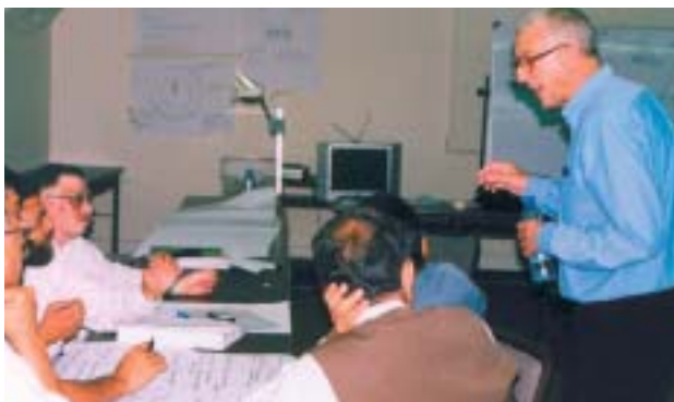
UNODC provided specialist training on illegal drugs for law enforcement officers in Pakistan

UNODC continued to provide a platform for regional cooperation against drug trafficking between Afghanistan, Iran and Pakistan. The Sixth Senior Law Enforcement Officers Meeting took place in Islamabad in December 2005. It provided a forum to discuss areas for collaboration and the exchange of intelligence information.