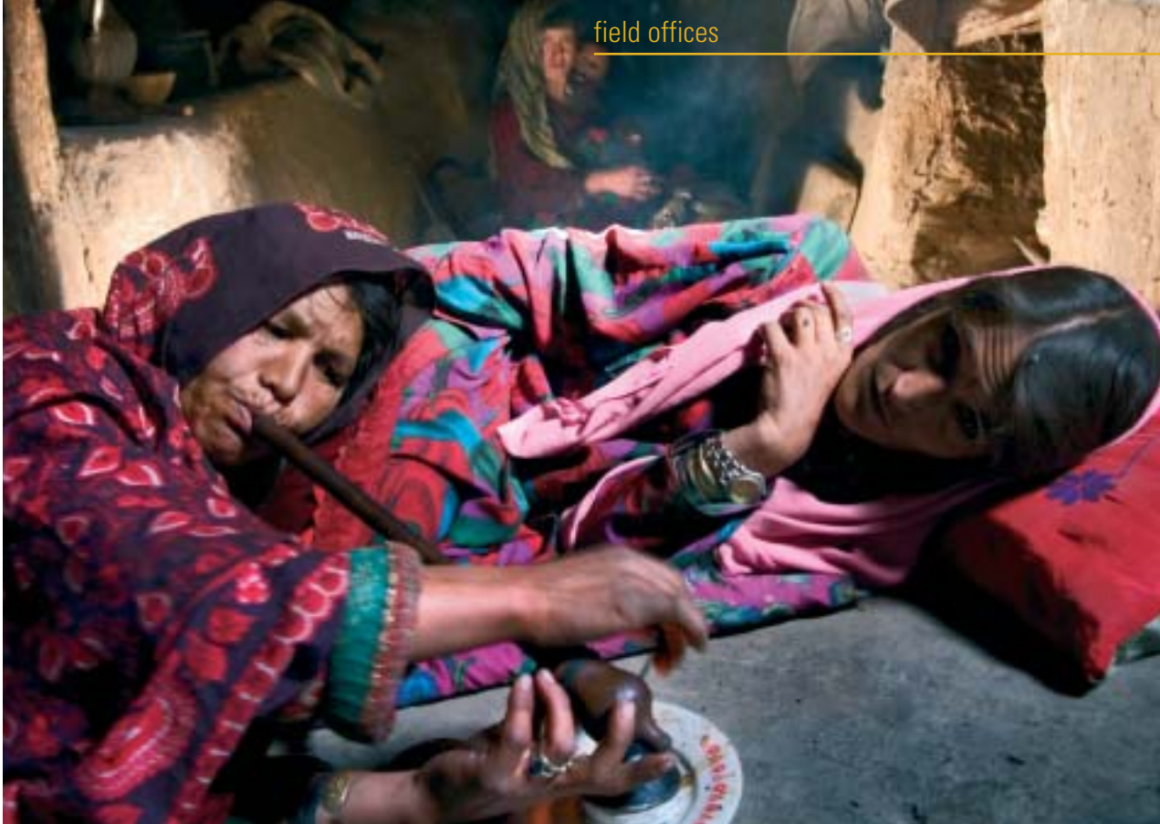
Afghan women smoking opium