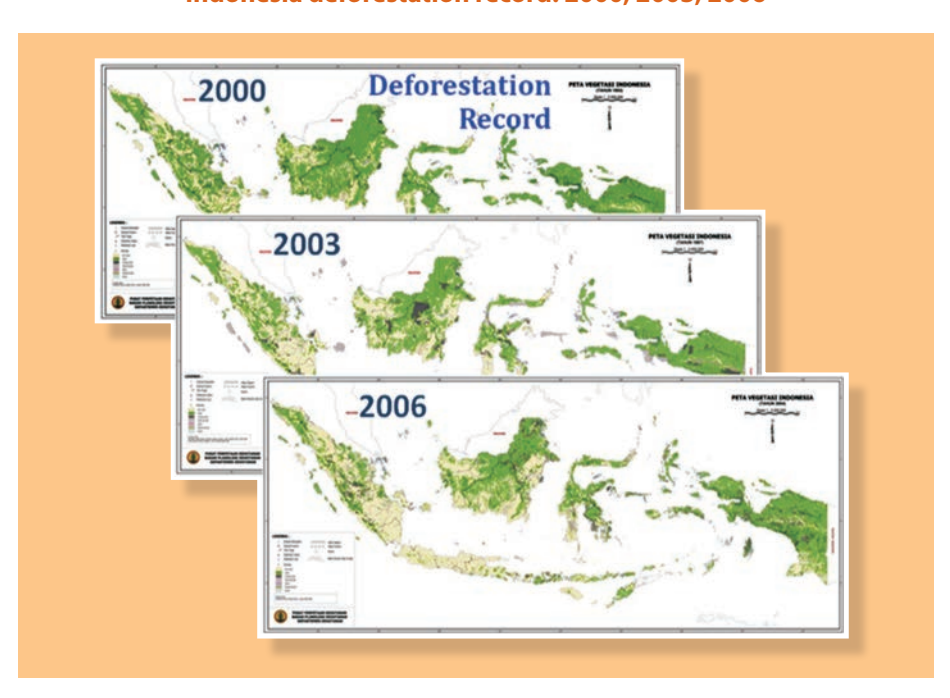
Figure 1 Indonesia deforestation record: 2000, 2003, 2006

Indonesia has the most extensive forest cover in Southeast Asia, which also has the most unique and high biodiversity values (FAO, 2000). This is why Indonesia's forests are often referred to as "the lungs of the world". However, Indonesia's forests are also the world's most rapidly disappearing forests. According to a Greenpeace report, between 2004 and 2009 Indonesia annually lost 2.31 million ha of forest cover; a high deforestation rate (cited in Diansyah and Sari, 2010).