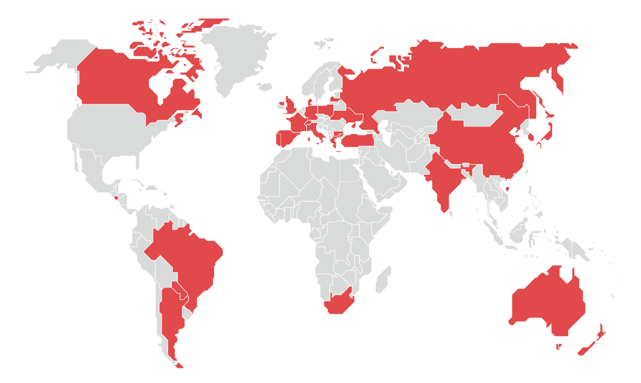
Map 2: Jurisdictions having specific match-fixing offences (2016)

Of the 52 jurisdictions reviewed, the study has identified 28 countries that have adopted or are in the process of adopting specific provisions criminalizing match-fixing. Before analysing these national match-fixing offences in more detail, we briefly present hereinafter the main features of the legislation.