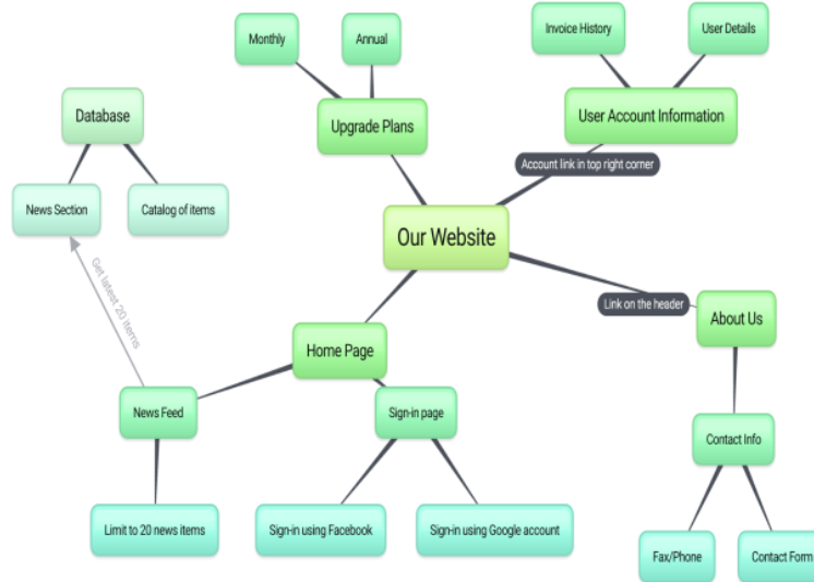
Example of a concept sketch.