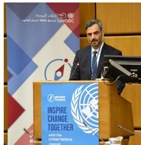
Undersecretary of the Ministry of Education of the State of Qatar delivering Welcome Remarks

The Director of Treaty Affairs opened the event, which was attended by 80 participants from member states, HEI, academics, and CSOs. The Director opened by thanking valued partners that have worked together with UNODC under the E4J initiative to produce valuable educational materials at the tertiary level. These materials, such as the E4J Module series help to achieve the SDGs, in particularly SDGs 4, 16 and 17.