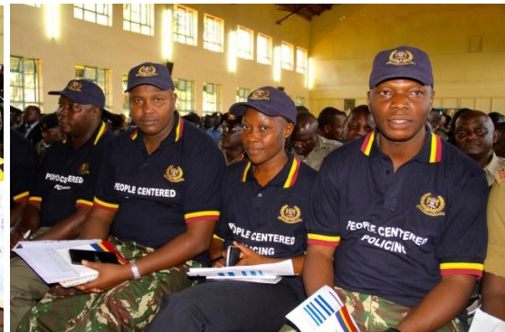
Right: NPS volunteer Reforms Champions during the launch