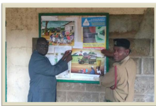
L: Champions at Nyatike Sub-County with Commanders R: NPS Reform Champion assists in putting up some of the illustrations at Ndaragwa AP Ward