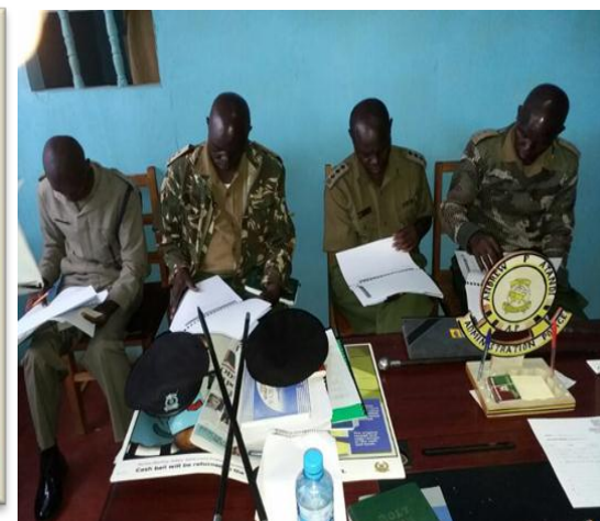
L: Kehancha Police Station in Migori County R: Nyangusu Police Station in Kisii County