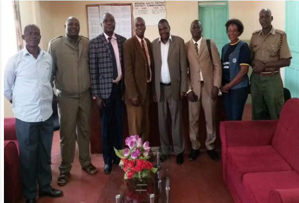
L: County and sub-County Commanders in Suba sub-County R: Masaba South in Kisii County