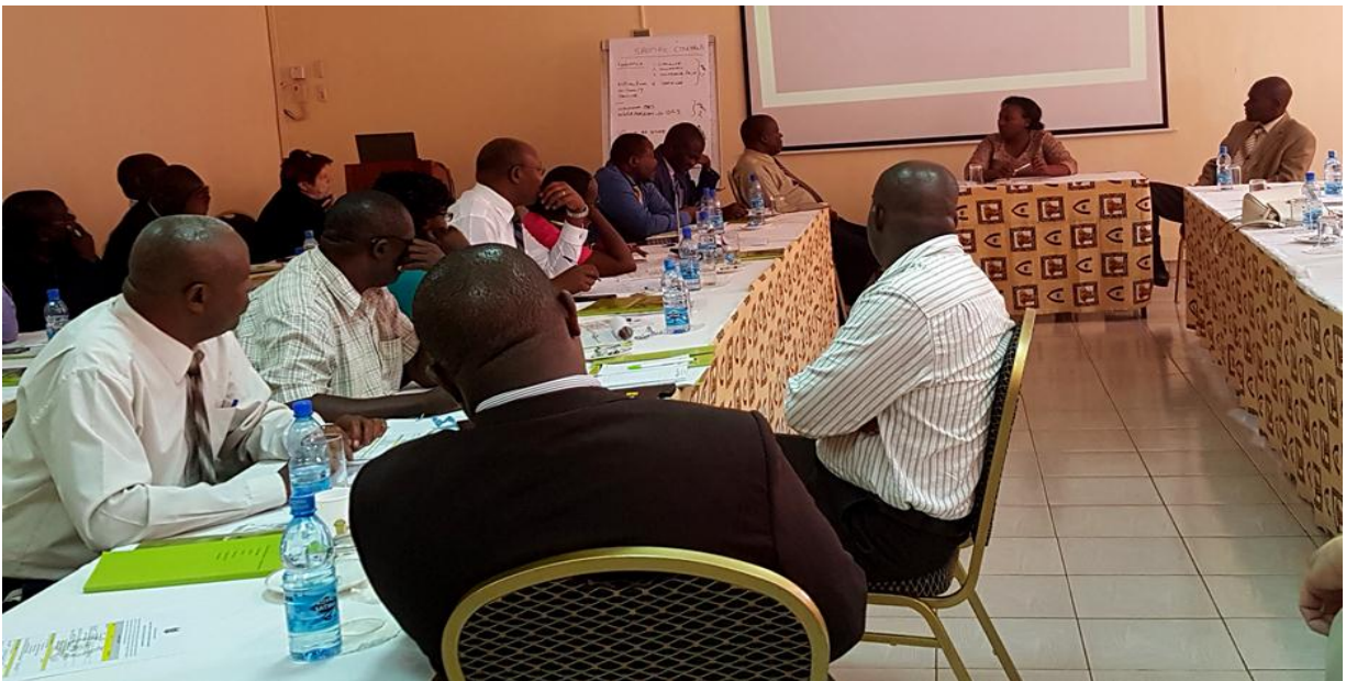
NPS Reform Champions participating in a simulation exercise on Mentoring and Coaching

The National Police Service Reform Champions participated in a one-day briefing meeting held on 24 March 2017. The briefing, which was facilitated by UNODC, was aimed at revisiting the key components of Mentoring and Coaching by the Champions – based on previous training undertaken. The Champions were fully equipped in preparation for the two-week long exercise of Mentoring and Coaching of Station and Ward Commanders in the 190+ Stations and Wards.