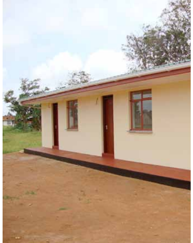
Refurbishment of staff housing at Shimo La Tewa Prison, Mombasa (pictures taken January 2010 and August 2010)