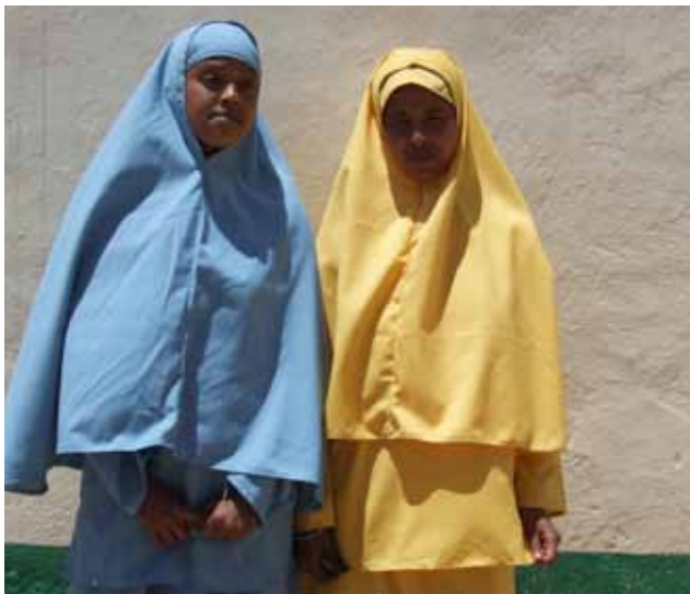
New female prison uniforms at Hargeisa Prison, Somaliland