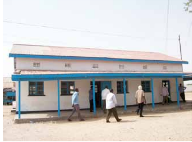
Berbera Court, Somaliland

UNODC seeks to improve the correction regimes in Somalia for two reasons. First, to ensure secure and humane imprisonment for those sentenced by local Somali courts. Second, improvement to the imprisonment regimes offers the possibility that those convicted of piracy in regional states may be transferred back to Somalia to serve their sentences.