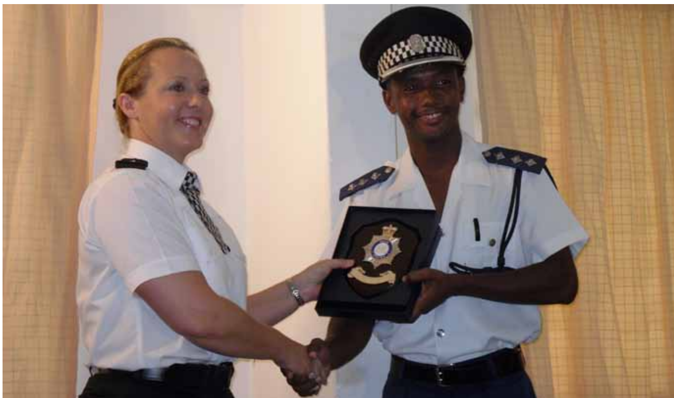
Seychelles Police Training funded by UNODC, August 2010