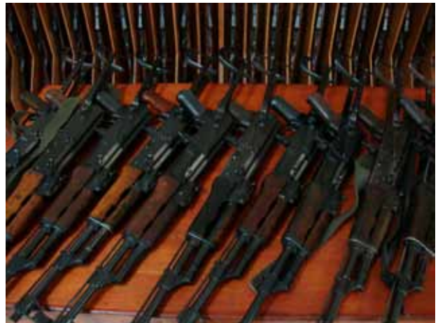
Weapons inspected by UNODC advisers at the Yemeni Coastguard Training Institute in Aden, December 2010