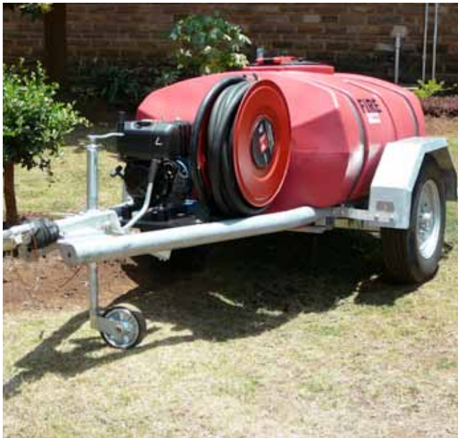
Portable fire-fighting equipment provided by UNODC at Kamiti Prison, Kenya