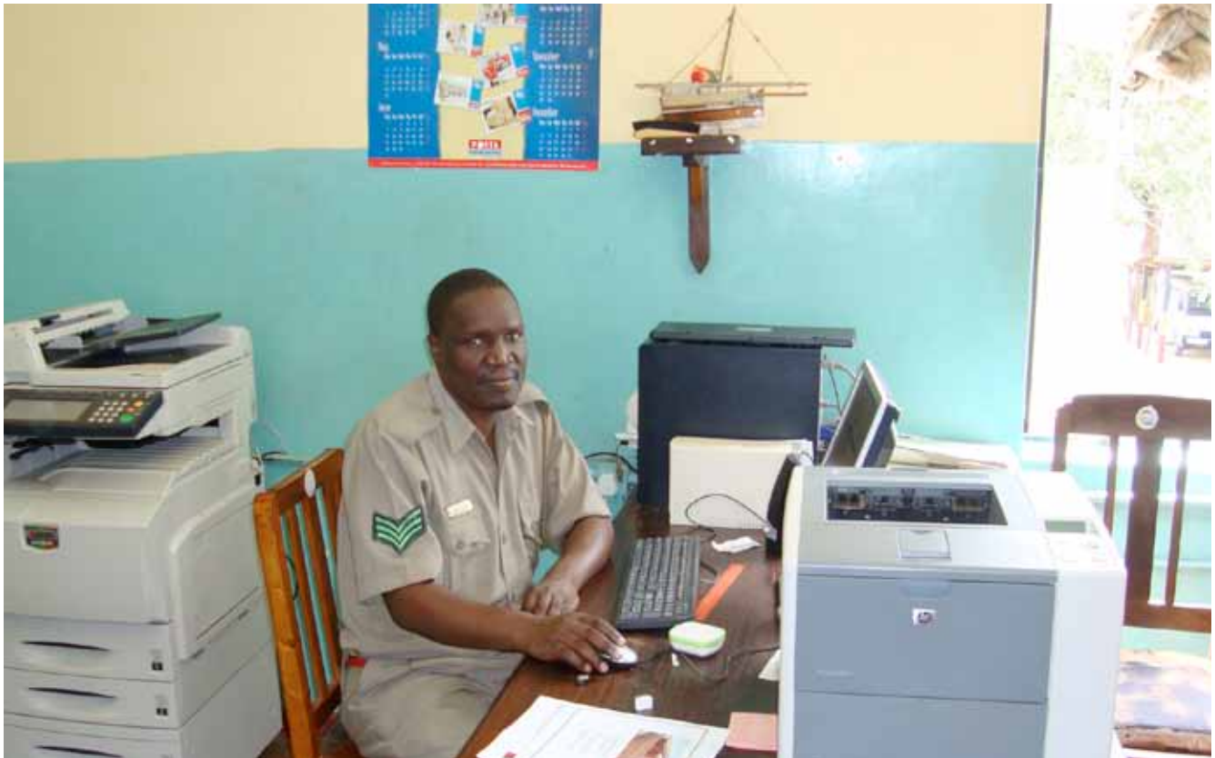
IT Equipment supplied by UNODC in Mombasa, Kenya