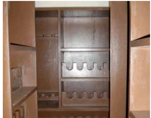
Refurbished armoury at Mombasa CID built by UNODC