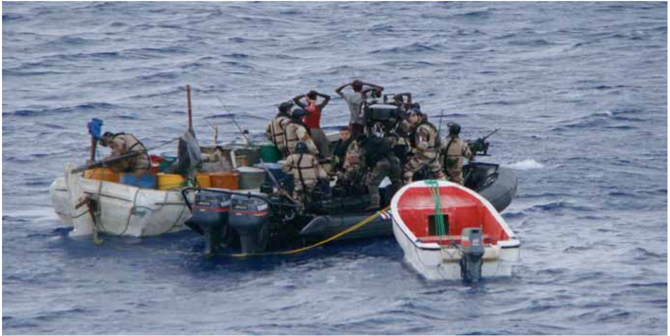
Above: EU NAVFOR interception of suspected pirate vessels.

Front cover: Prison officers at Hargeisa Prison, Somaliland