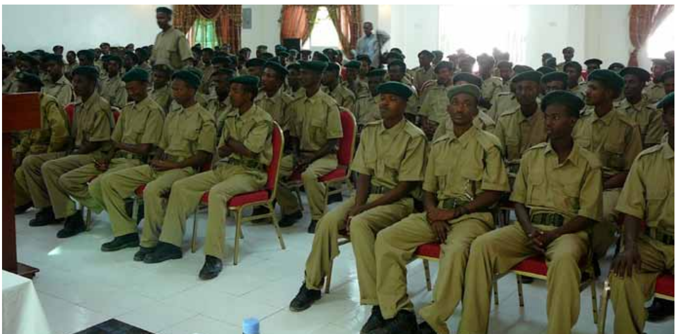
Graduation ceremony at Prison Officer Training Course at Hargeisa Prison, Somaliland