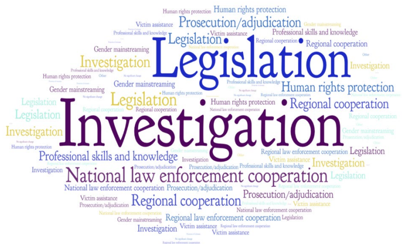
Figure 1: Word cloud - Online survey data: Concrete positive changes in one or more areas as a result of attended events in the GoG.

adopted Suppression of Piracy and Other Maritime Offences (SPOMO) Act of Nigeria, Harmonized Standard Operating Procedures in Benin, Ghana, Ivory Coast and Togo, strengthened capacity in law enforcement, prosecution and adjudication, and a published regional study ‘Gender Dimensions and Dynamics of Maritime Criminality, Response and Capacity in West Africa’. While effectiveness and impact have been limited, progress has been made towards strengthening the legislative framework and regional and national capacities in the field of investigations. However, the expectation to reach a higher number of prosecutions of alleged pirates has not materialized. This could partially be attributed to the downward trend in piracy in the region. Nevertheless, the segment may have contributed to maritime security and safety in the ECOWAS Region (see figure 1). In addition, the segment has been efficient to some extent, with major delays caused by the Covid-19 pandemic, but team flexibility, virtual training and an increased use of local capacity have provided the means to mitigate the consequences of