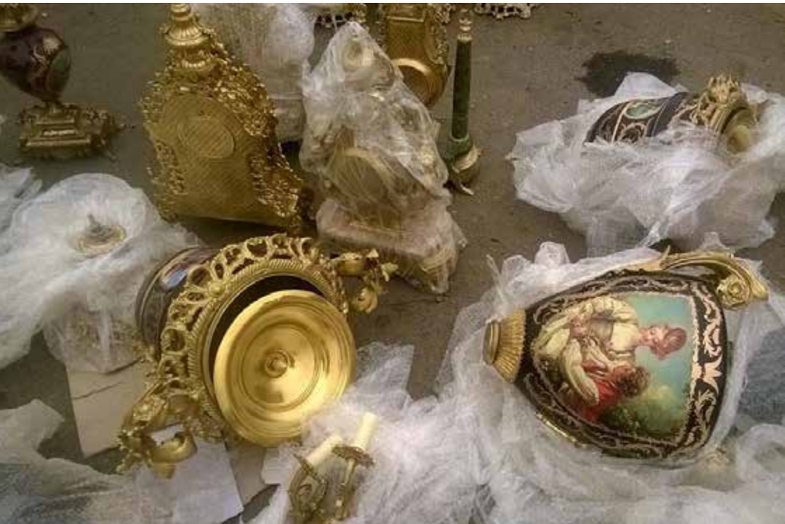
Porcelain artefacts from the Muhammad Ali Dynasty recovered during INTERPOL's "Monitor Eye" operation in Egypt in 2015.

Individuals or/and groups involved in the intentional destruction of cultural heritage, including looting, should be duly prosecuted.