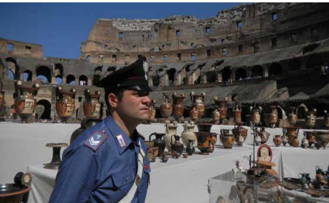
Press Conference held in 2010 at the Colosseum (Rome) by the Italian Carabinieri. Presentation of 337 antiquities recovered in Geneva (Switzerland) during the "Andromeda" operation.

To ensure the protection of cultural heritage, Italy, Jordan, INTERPOL, UNESCO, and UNODC have drawn up a list of suggested key actions. These are based on the outcomes of these meetings, the comprehensive guidelines adopted to support the implementation of the 1970 UNESCO Convention and the UN Convention on Transnational Organized Crime, and the priorities of experts working in the field.