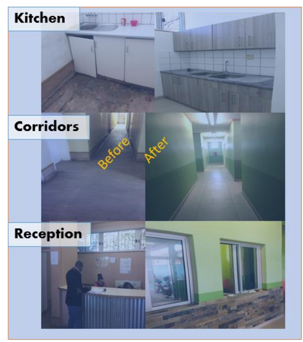
2PHOTOGRAPHS OF FACILITIES BEFORE AND AFTER THE RENOVATIONS OF THE GENDER BASED VIOLENCE PROTECTION UNIT IN KHOMAS