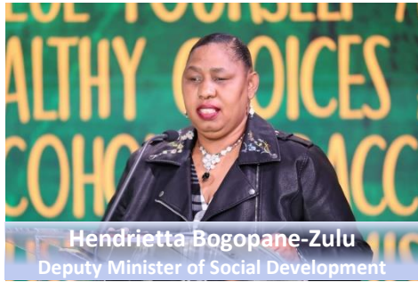
Hendrietta Bogopane-Zulu Deputy Minister of Social Development

Minister acknowledged Deputy Minister of Social Development, Hendrietta Bogopane-Zulu whose leadership was instrumental in the development of this Plan and the hard work by the Central Drug Authority (CDA) and relevant stakeholders who developed the Plan. “The goal of the of the National Drug Master Plan is to contribute to safer and healthier communities through coordinated efforts to prevent and treat substance use