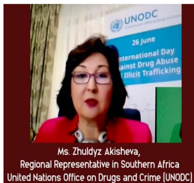
Ms. Zhuldyz Akisheva, Regional Representative in Southern Africa United Nations Office on Drugs and Crime (UNODC)

Addressing participants that included national authorities, youth leaders, CSOs and Academia on trends in illicit drug trafficking and abuse, UNODC Representative highlighted that the economic downturn caused by the COVID-19 has the potential to worsen levels of drug production, trafficking and use. According to the World Drug Report, the crisis may exacerbate the socioeconomic situation of vulnerable groups, who in turn may increasingly resort to illicit activities as a coping mechanism to compensate for the loss of licit income and employment. Ms Akisheva also emphasized specific challenges faced by women who use drugs globally and in South Africa,