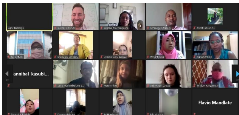
‘Building Networks’ Drug Dependence Treatment in Prisons Webinar, 2021