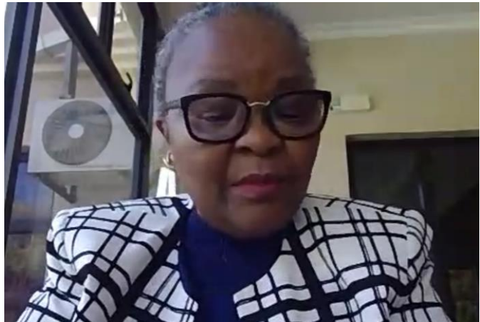
Figure 5 Hon. Justice Sanji Monageng; former judge of the International Criminal Court (ICC)

The keynote speaker at the meeting with SADC Lawyers Association was Hon. Justice Sanji Monageng; former judge of the International Criminal Court (ICC) in The Hague who also presently sits as a judge of the Southern African Development Community Tribunal (SADCAT) in Gaborone, Botswana. Hon Justice Monageng stated that: “SADC faces