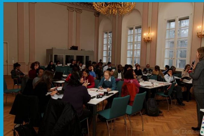
Feb 2011 CSO training at the IACA, Laxenburg