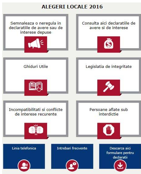
Figure 5. 2016 Local Elections Section

Moreover, in order to increase the level of prevention and awareness in relation to the 2016 elections, A.N.I. has identified a series of measures that have been grouped in a distinct section on ANI's website, that comprises all relevant information on the obligations that the candidates have in local elections, on assets and interests disclosures, on legislative references, as well as incompatibilities and conflicts of interest guides and guides for filling in assets and interests disclosures.