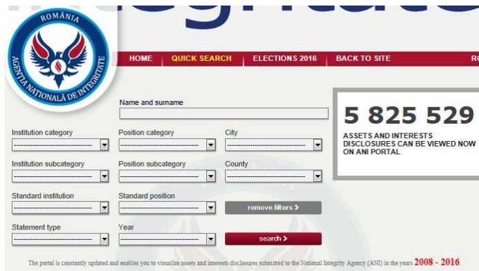
Figure 2. Assets and Interests Portal

With the aim of ensuring the transparency of the asset and interest disclosures, ANI developed an integrated information system for the management of the documents received in printed form. The disclosures are scanned and introduced in the portal on the Agency's website, available to all public persons. Searches (available in both Romanian and English) can be performed according to the following criteria: the dignitary's name, the public institution, the dignitary's office, the year when the disclosure was filed and the type of statement (of assets or of interests). At the moment, the portal encloses almost 6.000.000 asset and interest disclosures sent and filed to the National Integrity Agency between 2008 and 2016.