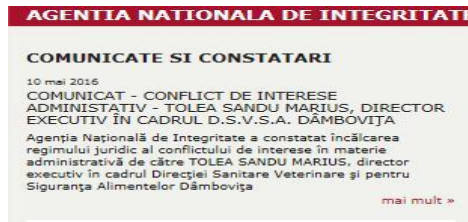
Figure 1. Press releases Section

With the aim of ensuring the transparency of the asset and interest disclosures, ANI developed an integrated information system for the management of the documents received in printed form. The disclosures are scanned and introduced in the portal on the Agency's website, available to all public persons. Searches (available in both Romanian and English) can be performed according to the following criteria: the dignitary's name, the public institution, the dignitary's office, the year when the disclosure was filed and the type of statement (of assets or of interests). At the moment, the portal encloses almost 6.000.000 asset and interest disclosures sent and filed to the National Integrity Agency between 2008 and 2016.