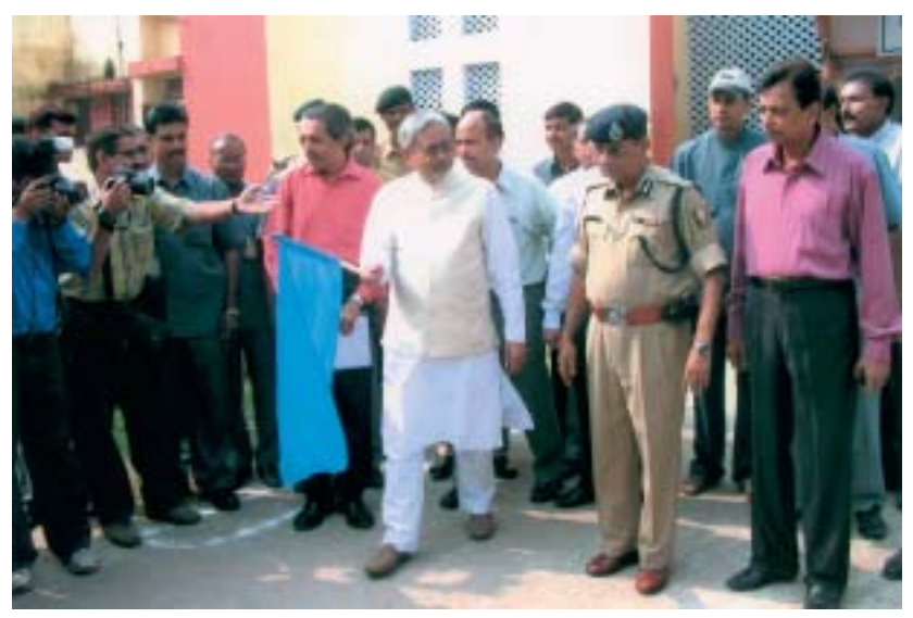
The Chief Minister of Bihar, launching the Integrated Anti Human Trafficking Unit (IAHTU) on 07 November 2007, in the presence of senior officials of the government and UNODC.

Officials supervising the IAHTU should ensure that all stakeholders in AHT (police, government officials, executive magistrates, NGOs etc.) are given regular training on all aspects to enhance/ refresh their knowledge (of the law, procedures, human rights principles, etc.), skills (technical and scientific as well as psychosocial methods in attending to victims/ witnesses etc.) and all related aspects.