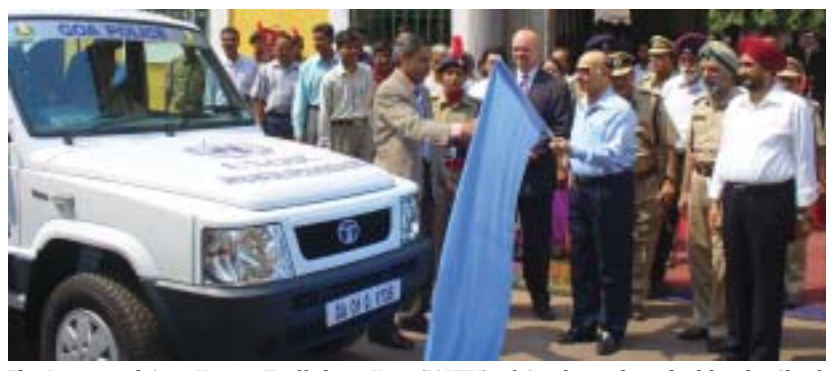
The Integrated Anti Human Trafficking Unit (IAHTU) of Goa being launched by the Chief Minister on 24 March 2007, in the presence of senior officials of the state government and UNODC.