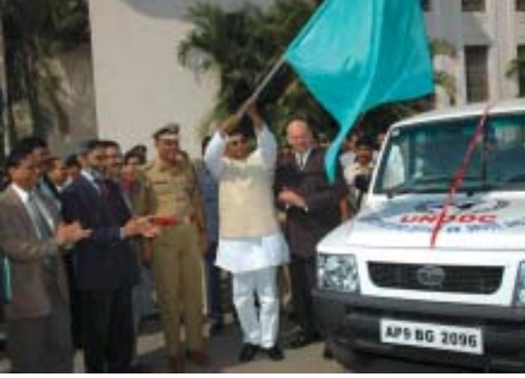
The Home Minister of Andhra Pradesh launching the first Integrated Anti Human Trafficking Unit (IAHTU) in India on 22 January 2007, along with UNODC and state government officials.

The mandate of IAHTU includes dealing with human trafficking for all types of exploitation, including forced/ exploitative labour. Therefore, the services of