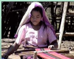
UNODC promotes traditional skills