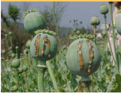
Poppy capsules at harvest time

Myanmar is the main producer of heroin in South East Asia, with most of its heroin laboratories situated in the border areas near Thailand and China. In addition, there has also been a steady increase in amphetamine production. ATS production is not dependent on weather conditions, it is cheaper to produce, and easier to conceal than opium. Cross border trafficking networks play a significant role in the smuggling of incoming chemicals and outgoing illicit drugs across permeable borders.