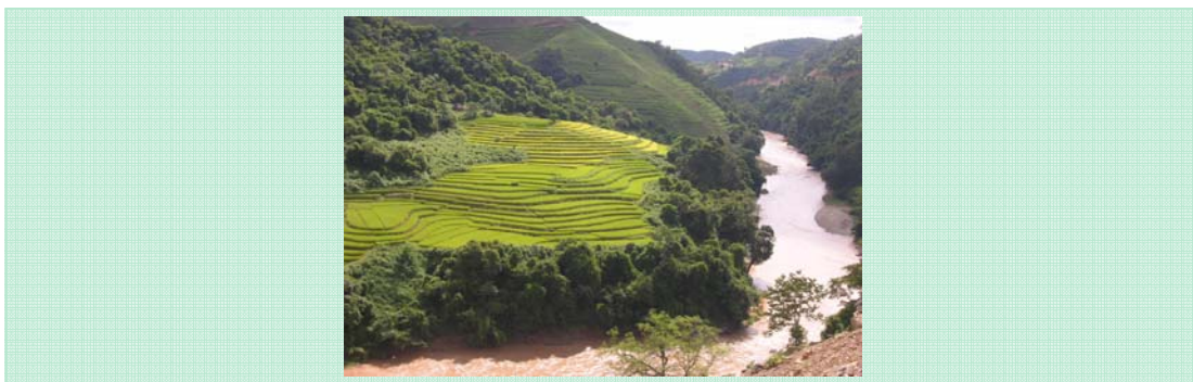
The Wa hills

Household economies in the Wa have long been impeded by the pressures of stark surroundings; opium poppy cultivation resulting in decreased household productivity and increased poverty, more than two decades of conflict, and most recently, the imposition of fast opium reduction strategies.