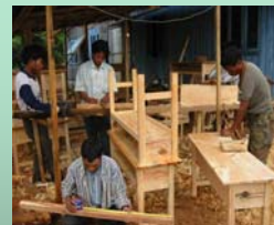
UNODC carpentry training

Vocational skills and alternative livelihoods can provide for self-sufficiency and improve the overall socio-economic situation of the Wa people