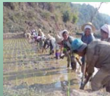
Villagers planting rice on a field prepared with UNODC support