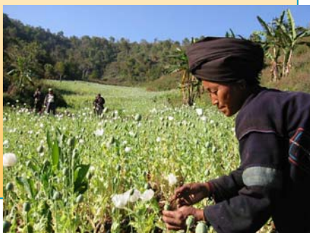
Akher woman cultivating opium

Opium poppy cultivation led to opium addiction in several areas of the Wa. Although opium poppy is chiefly grown for medicinal purposes, it is also grown to sustain family members' opium addiction. In