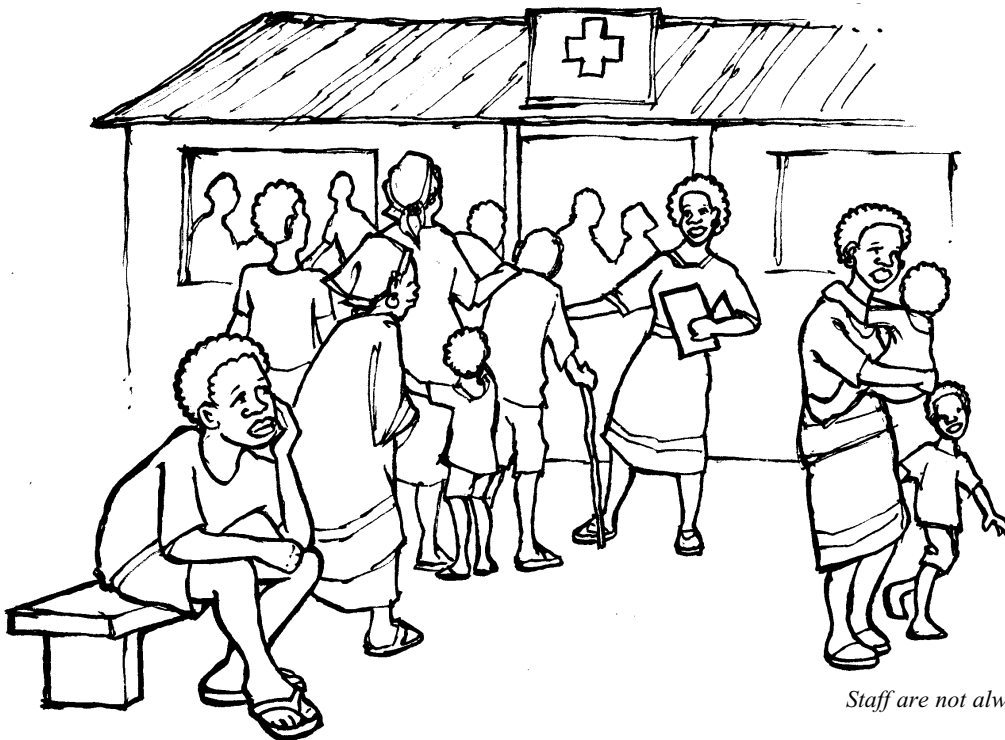
Staff are not always friendly to young people.

A youth from South Africa said: “the clinic staff aren’t always friendly to young people. The clinics are overloaded and have long queues. The staff are so busy they don’t have time to counsel people properly.....”