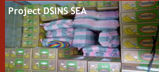
Project DSINS SEA

722.31kg of Cocaine 1 April 2020, Japan Customs