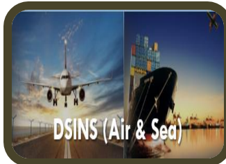
DSINS (Air & Sea)