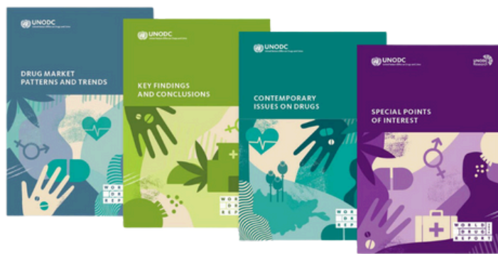
World Drug Report, 2024