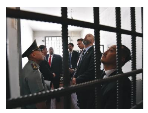
US Bureau of Counterterrorism visit to prison, Kyrgyzstan, 2022