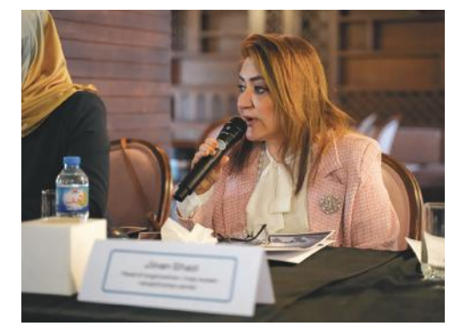
Meeting of civil society organizations, Iraq, 2022