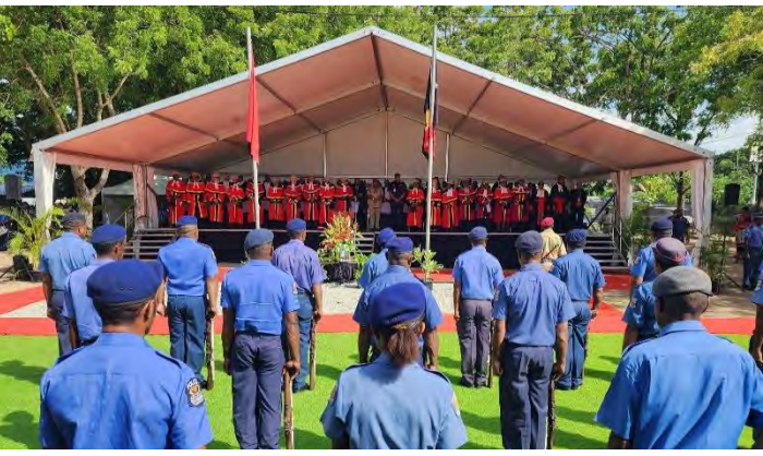
Assembly of police officers in Papua New Guinea (PNG) – April 2023