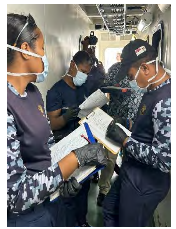
Maritime Police Officers training session – May 2023

It is anticipated that this training will be conducted in other Pacific Island Countries, specifically for maritime law enforcement officers who conduct maritime surveillance in their respective exclusive economic zones to ensure their border is safe from any/or all forms of maritime threats.