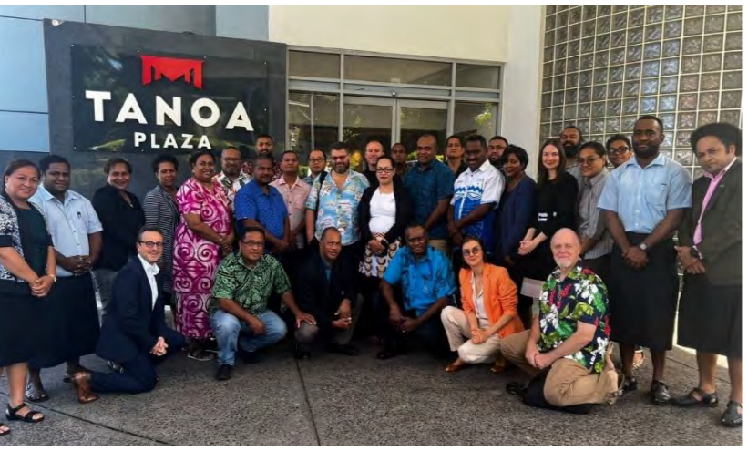
Participants of the Regional Forum on TIP and SOM – April 2023

Suva (Fiji), 18-19 April 2023 (UNODC) - The Regional Forum for TIP and SOM, held in Suva on 18<sup>th</sup>-19<sup>th</sup> April, provided а platform to share recent knowledge on trafficking in and smuggling persons of migrants, with experiences and lessons learned from research and